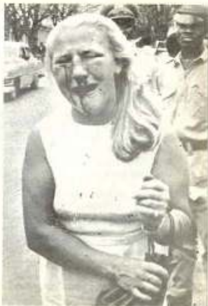
These pictures were smuggled out of one of the "emerging", (nigger) nations of Africa after "independence", -when the White-

Here a nigger wants the White Woman's bicycle and just goes up and takes it. When the woman tries to resist, she is beaten bloody by the black savage. The ugly "citizens" stand around and enjoy this scene of White degradation and humiliation. The Whites are on the RUN all over the world. The American Nazi